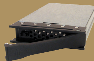
DX115 DC Carrier