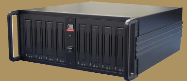
RAX845DC- 4U 8Bay