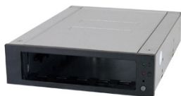
DX115 DC Frame Only 6602-6500-0500