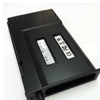
DC Adapter 6603-6500-0500