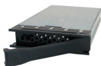
DX115 DC Carrier Only 6601-7100-0500