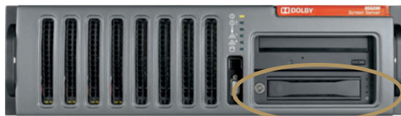
Dolby DSS200 for example Shown with 6602-6500-0500 Frame and 6601-7100-0500 Carrier