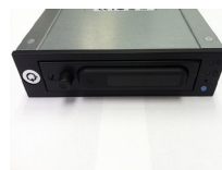
DCmini Cartridge + Adapter in DX115 DC Frame