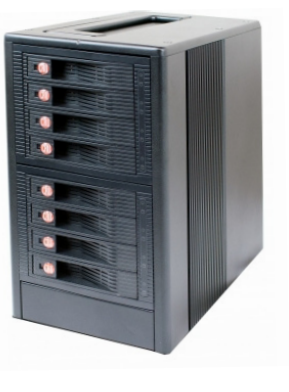
Models Covered: RTX800-XJ

Visit www.cru-dataport.com to download the complete User Manual.