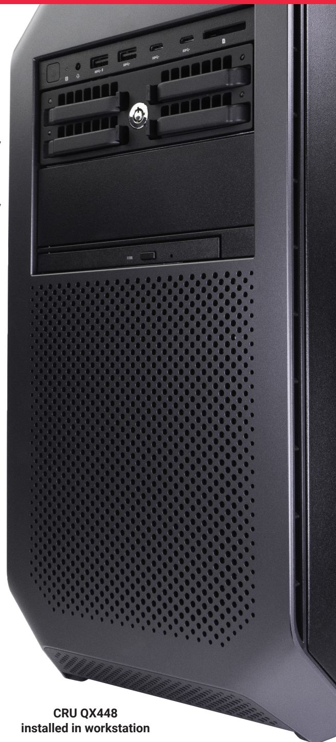
CRU QX448 installed in workstation

A SHIPS-compliant module is interchangeable among a variety of device types, from edge/IoT to desktop to custom systems. CRU will provide engineering details to developers designing custom systems.