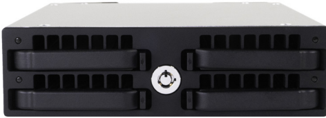
Four-module CRU Qx448 device for standard 5.25" bays, built to withstand tens of thousands of opens